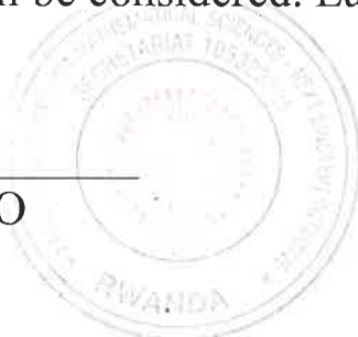
Lydie Hakizimana / CEO

Please note that all documents must be received no later than 16:00 hours CAT on 20 July, 2020 at ttp-procurement@nexteinstein.org . Only bids sent to this email address will be considered. Late bids will be rejected.